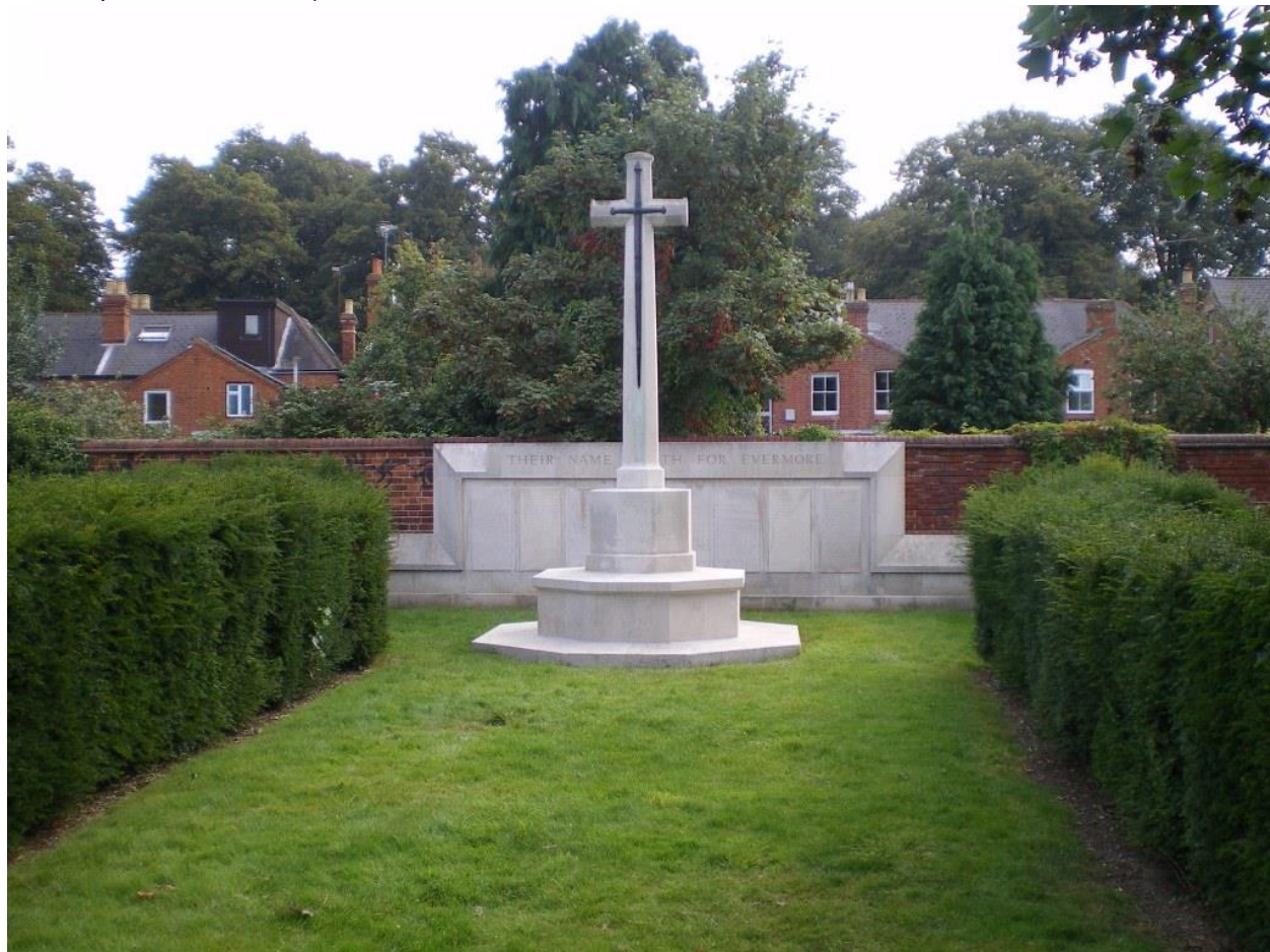
Cross of Sacrifice & Memorial Screen Wall, Reading Cemetery, Reading, Berkshire